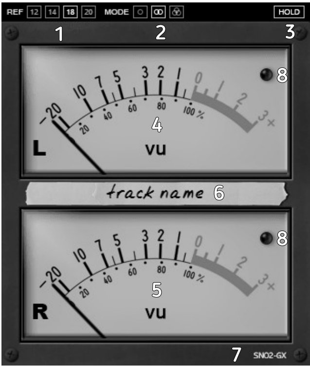
Figure 3. - extended GUI