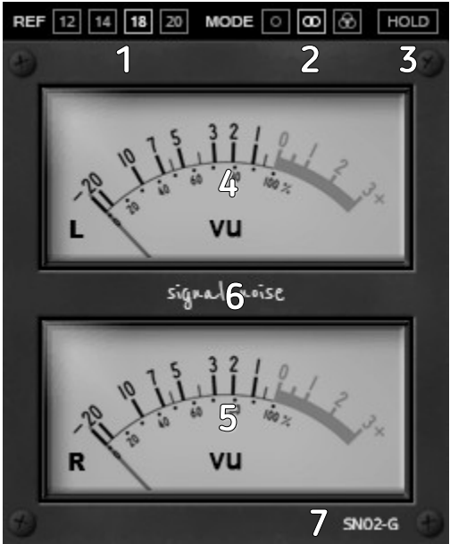
Figure 2. - standard GUI

Legend: mono - ○ stereo - ∞ mid/side - ⊗